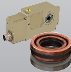
On-Axis Position Sensors