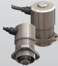
Geared Position Sensors